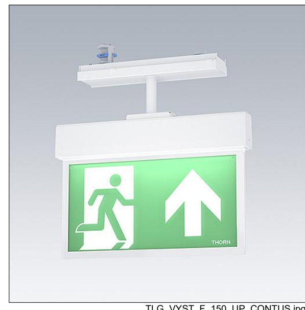
TLG VYST F 150 UP CONTUS.jpg